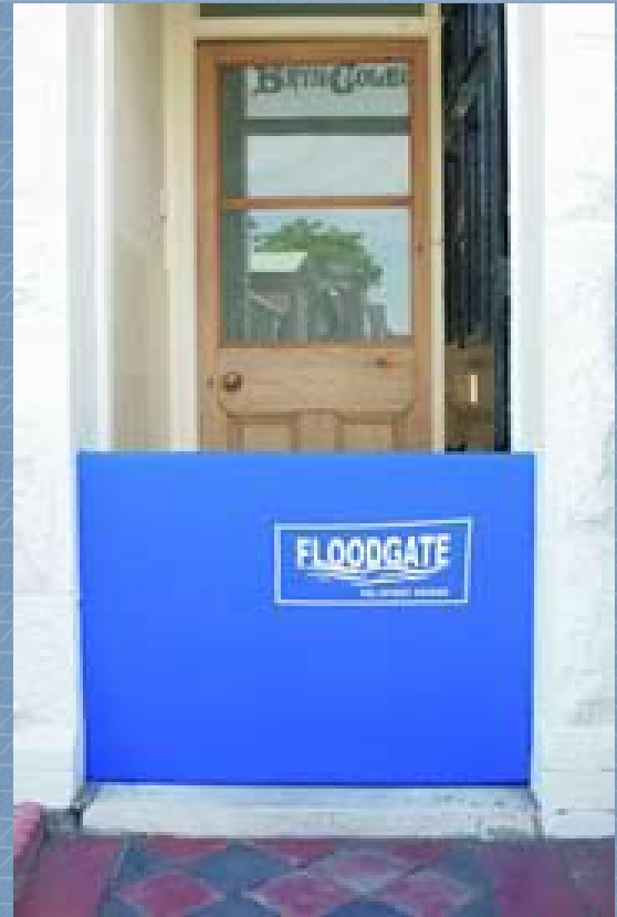
Front of Unit