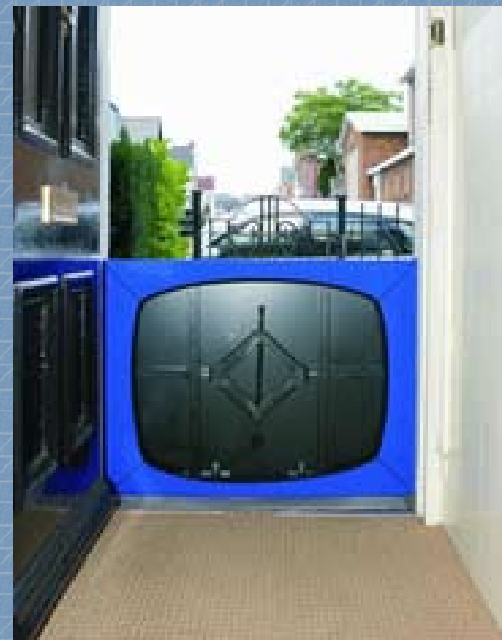
Rear of Unit